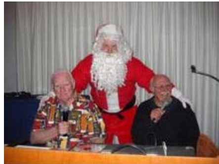
Friends Christmas Party