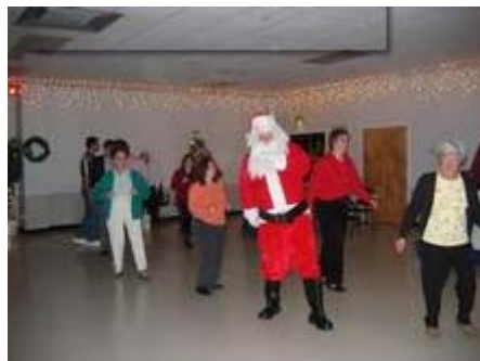
Friends Christmas Party