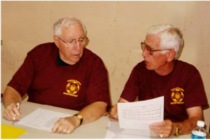
Soccer Shootout 2005