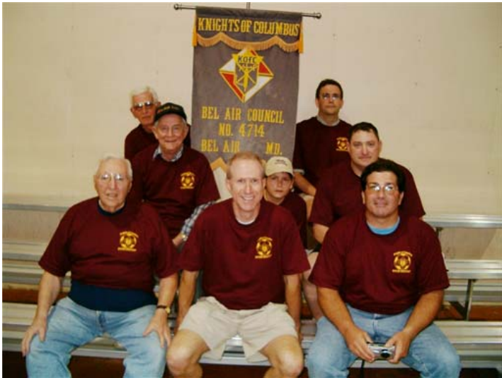
Soccer Shootout 2005