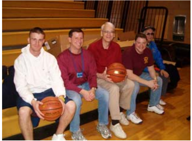
Free-throw Contest 2006