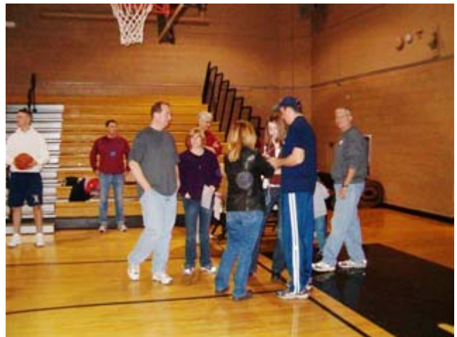
Free-throw Contest 2006