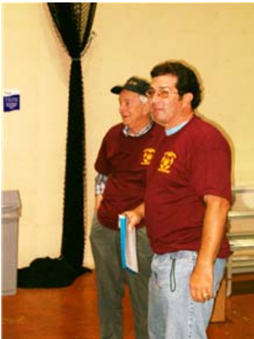
Soccer Shootout 2005